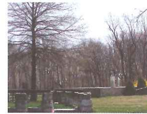
August 4, 2005 PAOLI BATTLEFIELD, MALVERN 9

Main Street in an iron and steel company town takes on a new life full of interesting architecture, attractions and historical sites. Using the former Phoenix Steel foundry building, see the revitalization under progress and observe the nearby company owned worker houses. Standing before the three-story heritage mural, learn about the iron and steel milltown that developed around the 18th century farmhouse next door. Walk and hear about the lovely homes on Main Street, including the Carnegie Library and the textile proprietor's mansion.