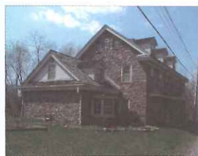
July 21, 2005 PARKER FORD 7