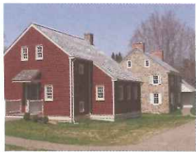
June 9, 2005 HISTORIC SUGARTOWN 2

The Battle of Paoli was not a massacre and it was only partially a surprise attack. Malvern's walking tour this year will be the Revolutionary War Battlefield that has been in the news so much. Come hear the details about "The night of September 20-21, 1777." Guides positioned at key locations on the battlefield will interpret the action that occurred that fateful night. Listed on the National Register of Historic Places, this important historical site has not changed as a cornfield for over 225 years.