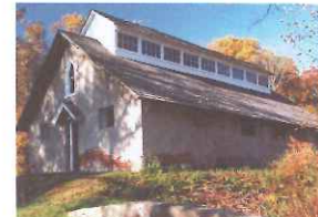
August 11, 2005 HISTORIC YELLOW SPRINGS 10

The first German congregation in Chester County erected a log church in 1747 along the Ridge Road. The members were the joint German Lutheran and Reformed Church. In its place is Zion Lutheran Church (the Old Organ Church) named for its famous 1791 Tannenberg Organ still there. See scars from the church's uses a hospital during the Revolutionary War. Next door, Bonnie Brae Park was a popular spot for recreation in the early 20th century. Phoenixville's urban workers used the trolley for a day in the country and riding the popular carousel.