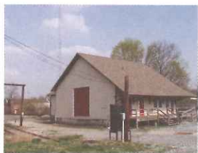
June 23, 2005 KENNETT SQUARE 4

An architecturally intact crossroads village of the late 18th and early 19th centuries, Fairville began as a service and market center on the Kennett Pike, Route 52, about 1744. While the Fairville Inn accommodated travelers passing through the village, the Fairville Forge, a store, post office, and cobbler shop fulfilled the needs of the residents and the school educated its children. You'll get an inside look at some of the significant buildings that make up this National Register Historic District.