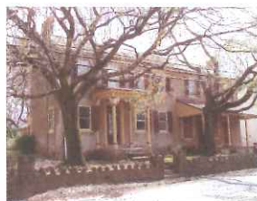
July 28, 2005 CEDARVILLE 8

Kennett Square is celebrating its Sesquicentennial this year. In conjunction with that, our Town Tours and Village Walks theme will be organized around the history of the town. We will begin where the first European settlement was established at the crossroads of what is now Routes 82 and 131 (Union and State Streets). We will see the homes or birthplaces of writers, inventors, and sports figures. Our tour will end at the History Station with a review of our Quaker background and its impact on the abolitionist movement.