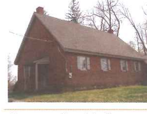
August 25, 2005 MARLBOROUGH VILLAGE 12

Cedarville, a country village in North Coventry Township, was settled about 1840 and called Stumptown. Because there were so many cedar trees, the name was changed to Cedarville in 1878. Stroll with us to see a 120-year-old church; the buildings that housed a country store from 1850 to 1995; plus a school that was the first high school in North Coventry and is now beautifully preserved as a residence. See the Farmer's Union Hall built around 1870 as a meeting place for area farmers that later became the Grange Hall in the 1920's.