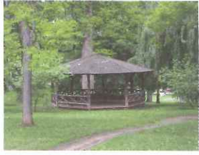
June 2, 2005 WEST CHESTER: A STROLL AROUND THE SQUARE 1

Sponsor: West Chester Historical and Architectural Review Board Tour Reservations: 610-918-7348