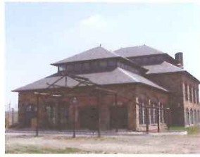
July 7, 2005 PHOENIXVILLE 5

Come! Explore our Northeast Neighborhood nestled around our oldest park — Marshall Square. Discover treasures hidden off the beaten track. Behold school buildings, manses, and wedding presents. Learn why Marshall Square was the popular destination for evening strollers in the 19th Century. Tours will start and end at the Gazebo in Marshall Square, Biddle and Matlack Streets. Pick from eight tours that will wend their way among sites dated from 1813 to 1950.