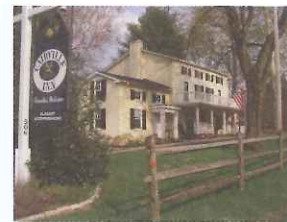
August 18, 2005 FAIRVILLE 11

Known for its vibrant 18th and 19th century history and folklore, Parker Ford will come alive again through its living history presentation. Learn about the village commercial enterprises as well as the daily lives of early residents. Step back in time and hear how the village was a bustling stop on the Schuylkill Canal and also the location where Washington's Army crossed the Schuylkill River in an attempt to block the British advance on Philadelphia after his defeat at Brandywine in September 1777.