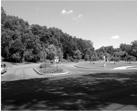
The preservation of mature woodland significantly reduces the visual impact of new development.