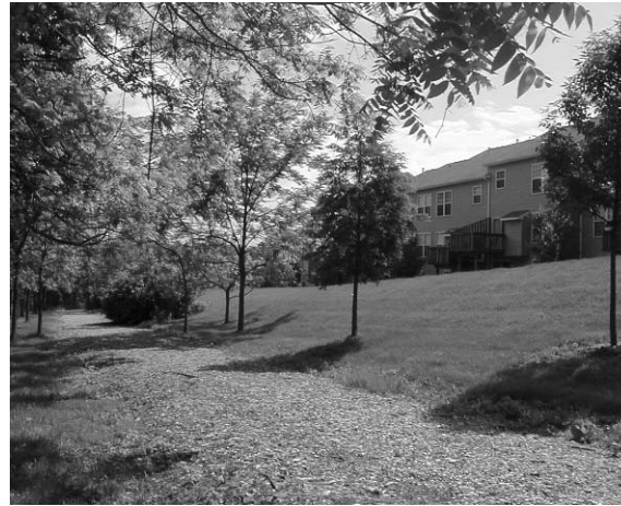
The trail system is well landscaped and accessible from most areas in the development.