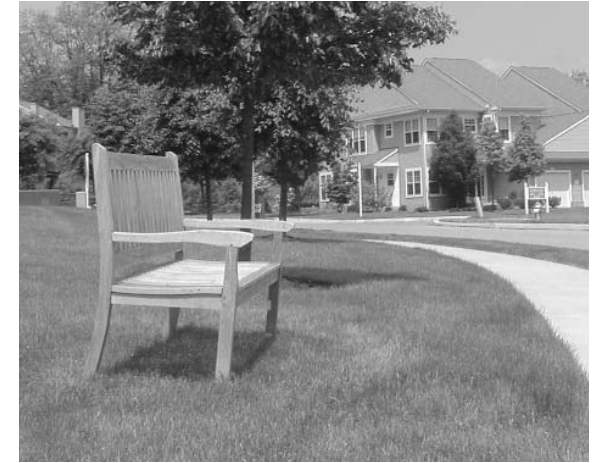
Pedestrian facilities and amenities are located throughout Charlestown Hunt.

Once within the development, the narrow roadway and extensive sidewalk and trail system create a pedestrian-friendly atmosphere. The open space areas not only screen adjacent roadways, but also provide green common areas throughout the development. Stormwater management facilities within the development are beautifully landscaped and screened and provide necessary infrastructure as well as a community amenity.