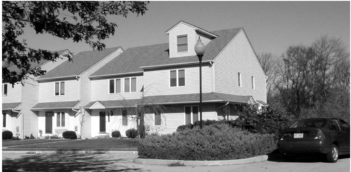
Landscaped parking islands and traditional street lighting enhance the parking and reduce impervious surfaces.

Pinebrooke is pedestrian-friendly, attractive, and successful in its integration and preservation of open space. This development also provides an effective buffer between the residential use and agricultural use, where conflicts can often occur.