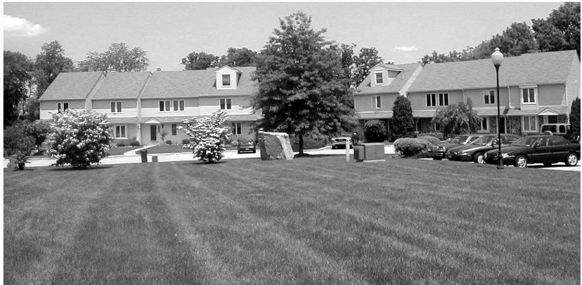
The central green creates a community focal point within Pinebrooke.