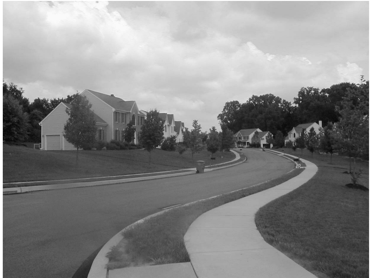
A narrow cartway and sidewalks promote pedestrian circulation within Uwchlan Woods.

This development was selected solely by the characteristics that were displayed within this phase; these design elements may or may not be exhibited in other phases of the Williamsburg development.